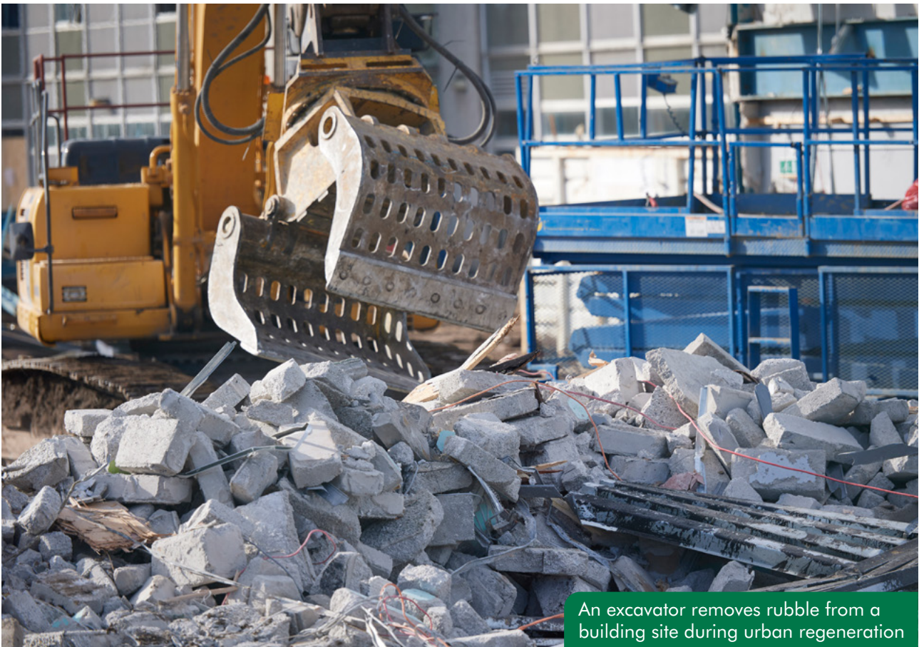
An excavator removes rubble from a building site during urban regeneration