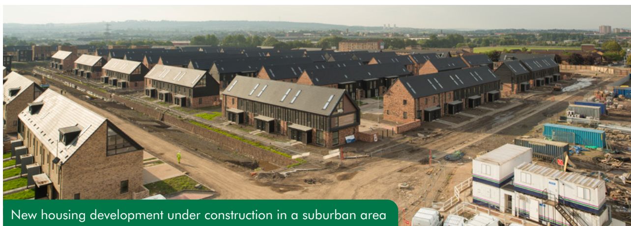
New housing development under construction in a suburban area